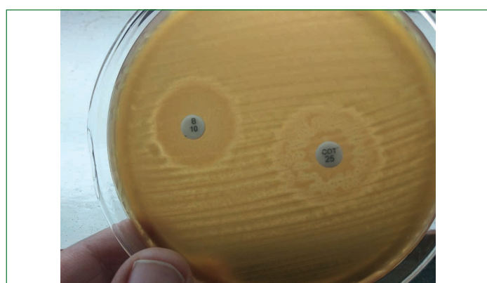
[Table/Fig-5]: Bacitracin and Cotrimoxazole susceptibility testing.