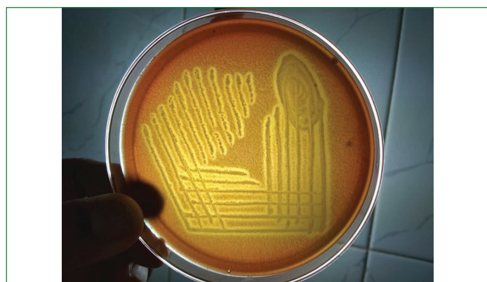
[Table/Fig-4]: Beta haemolysis around Streptococcus pyogenes colonies.